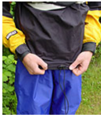
2. Line up dry top inner skirt with bib's outer skirt.