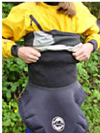
6. Pull up your spray skirt.