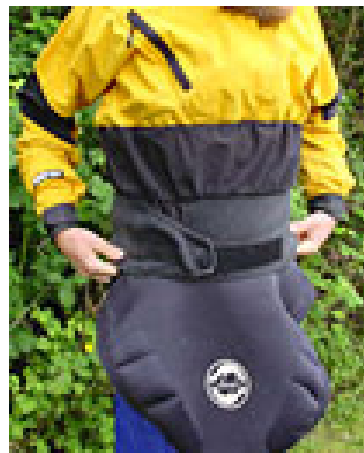
7. Pull down & seal your top's skirt over your spray skirt.