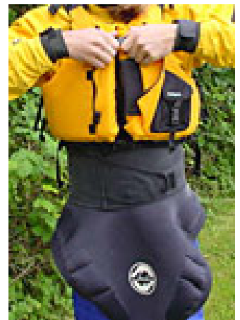
8. Put on your life vest and you are ready to go!