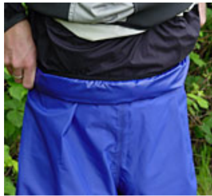
3. Fold together inner skirt on dry top with bibs outer skirt.