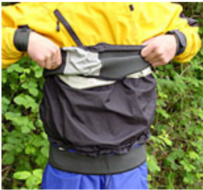
1. Put your dry top on over the bib. Pull dry top outer skirt up to chest.

The images below show how to join a two piece system together when using a spray skirt (bib shown in blue).